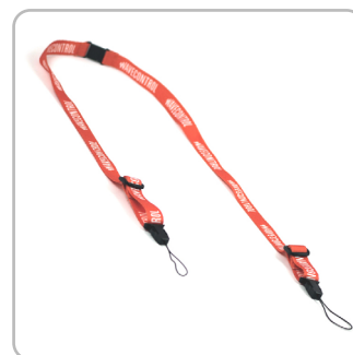
WaveMon Lanyard Part # WWMA0003