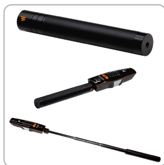
WaveStick Part # WWMA0002

Adjustable extension stick (73 cm / 28,74 ")