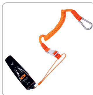
Safety cable Part # WWMA0001

Adjustable extension stick (73 cm / 28,74 ")